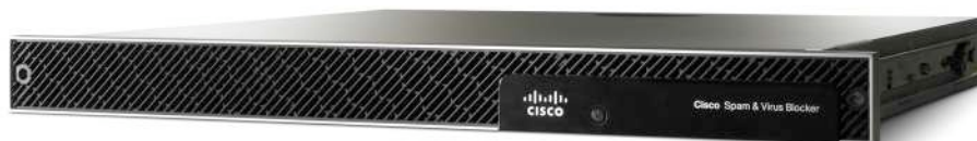
Figure 1. Cisco Spam & Virus Blocker